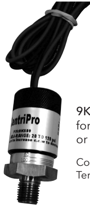
9K589 Over-Pressure Switch for use with Aquavar SOLO or "S-Drive" Controllers