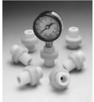
6K210 Gauge Guard

Float Switches - tested for use with Aquavar SOLO Controllers