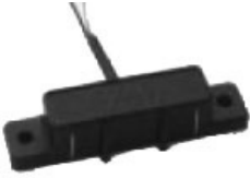
9K585 Moisture Sensor with Relay